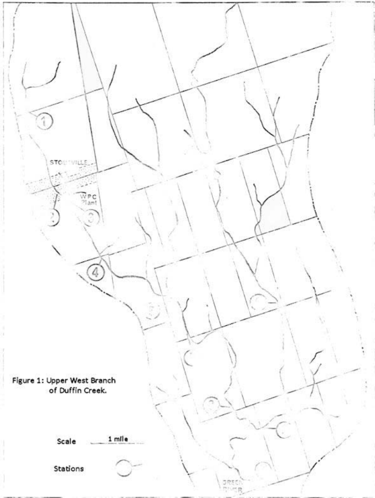
Figure 1: Upper West Branch of Duffin Creek.